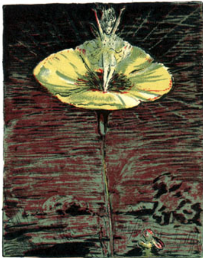
The Fairy Flower

"You were Real to the Boy," the Fairy said, "because he loved you. Now you shall be Real to every one."