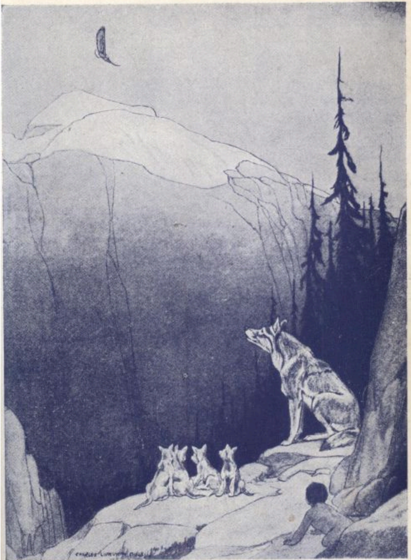
THE BABY WOLF-BROTHERS SAT IN A ROW . . . SNIFFING WITH THEIR PUPPY NOSES